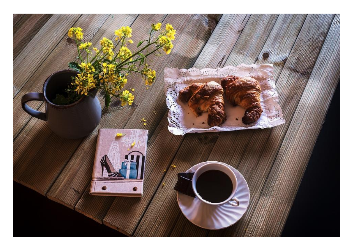
www.coachingibt.com Copyright © 2016 Agnes Klocokova – I.B.T. All Rights Reserved.

Think about each Positive Emotion and try to create YOUR OWN QUOTE. You are unique in your own way. As an author of YOUR QUOTES you can INSPIRE yourself and others, too. I will be happy if you share them with me. And now find a cozy place to read and enjoy.